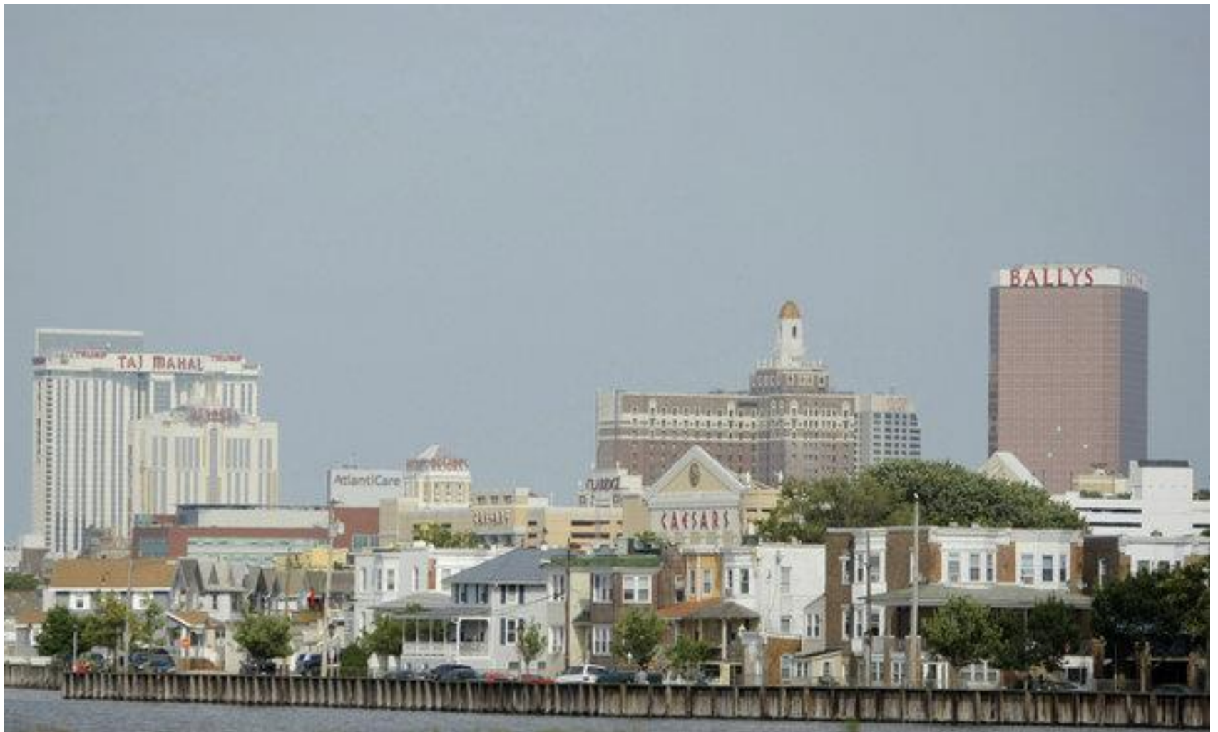
A view of the Atlantic City skyline in 2010