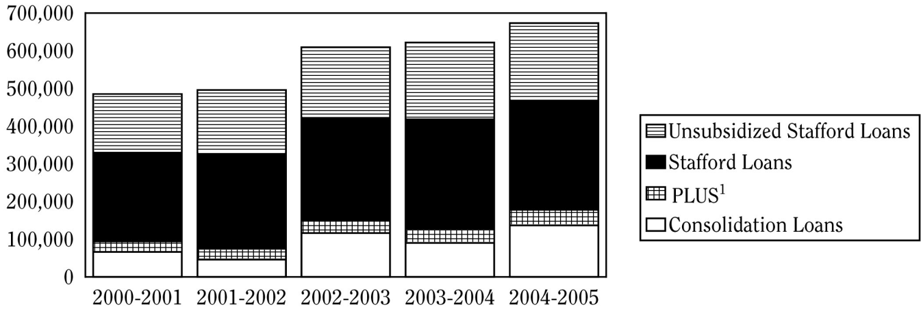
FIGURE J-1 Number of Student Loans Guaranteed New York State — 2000-01 — 2004-05